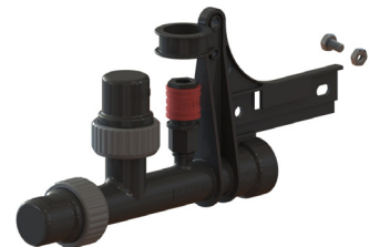
02204046 Modular Line End quick release Multi COM.