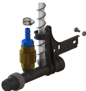
02204042 Modular Line End Barbed Sight Tube 3/4" BSPT W/Non- Return Valve COM.