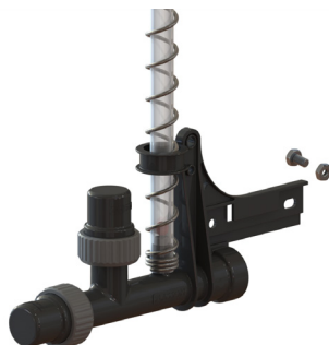
02204044 Modular Line End Barbed Sight Tube Multi COM.