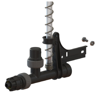
02204045 Modular Line End Barbed Sight Tube W/Flex Hose Adaptor COM.