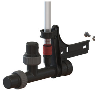
02204043 Modular Line End Detachable Sight Tube Multi COM.